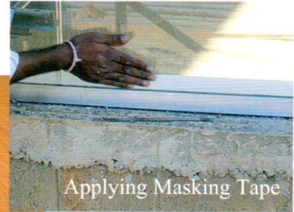
Applying Masking Tape